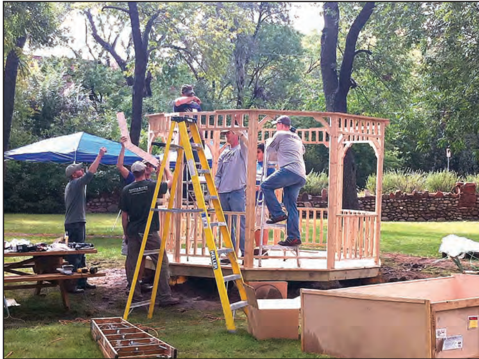
RLH employees work with Family Life Services on site to install a new gazebo.